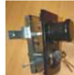
(optional) Cylinder Euro Locking £38