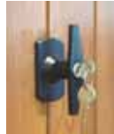
Standard 'T' handle