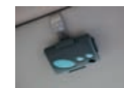
Handset Cradle and Sun Visor Clip (optional extra)