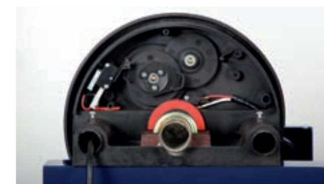
Inner workings of Glidermatic GRD™