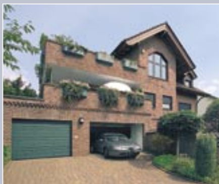
The classic M panel, a firm favorite for decades