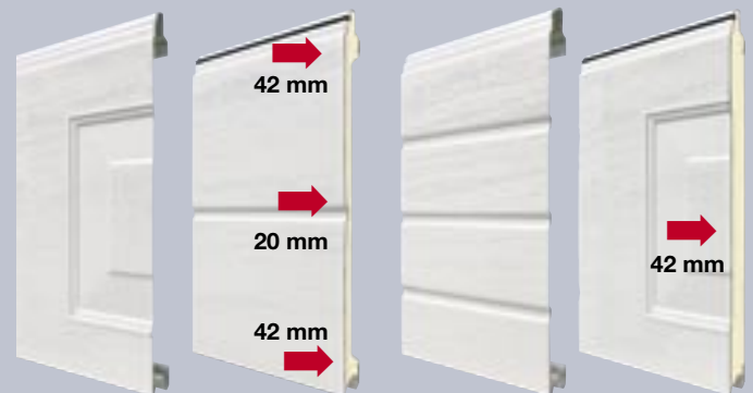
ETE 40, single-skinned