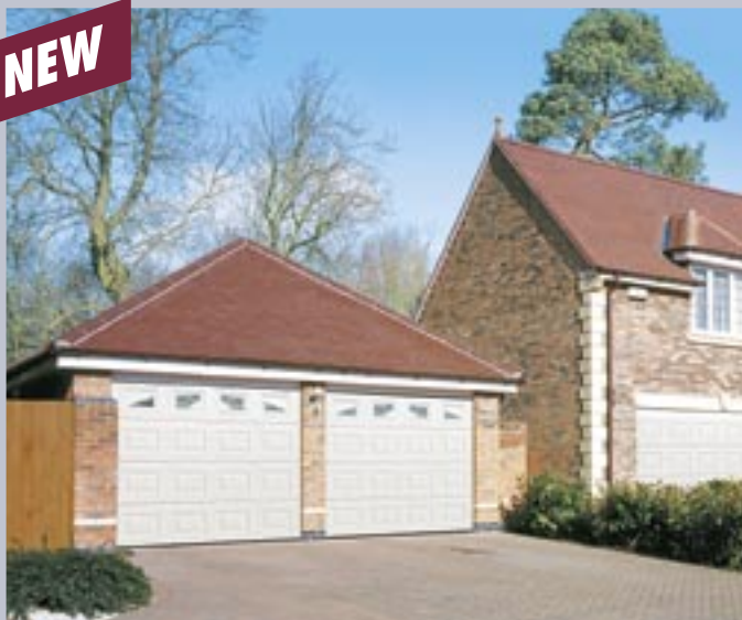
The attractive Sunrise Designs