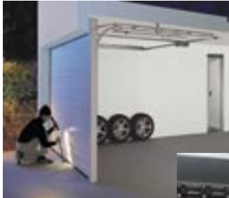
Break-in security system, a Hörmann patent

Optimal security, practical accessories... ...Hörmann offers it all!