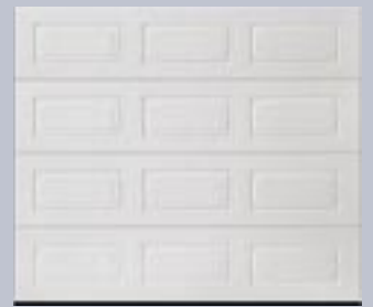
LTE 40, LPU 40, M-panel single or double-skinned