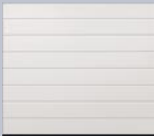
ETE 40, EPU 40, M-ribbed single or double-skinned

Your decision to buy a Hörmann sectional door is the right one