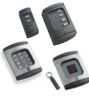
A wide range of practical accessories: key switches, internal buttons, code switches,...

The competitively-priced operator with an elegant, slate-grey plastic cover.