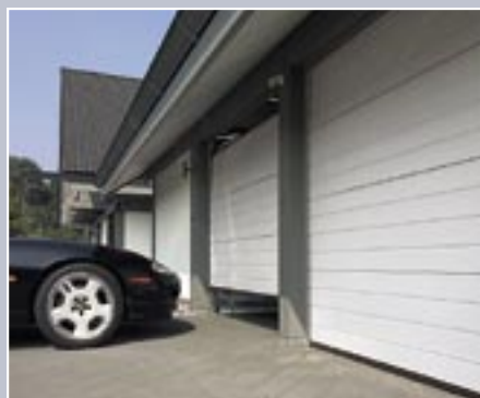
Excellent value for money, single-skinned S-ribbed sectional doors