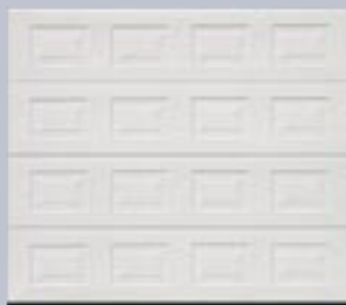
ETE 40, EPU 40, S-panel single or double-skinned