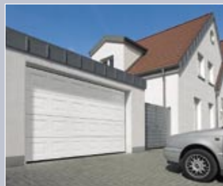
The coating is a perfect base if you want to paint your door in a special colour