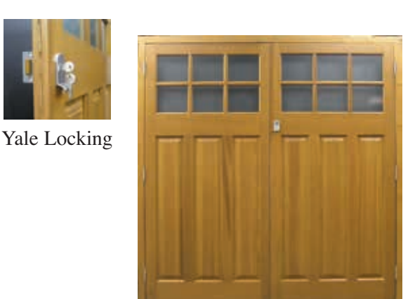
MIDDLETON with Modern hardware