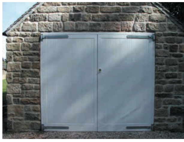
BAKEWELL in white