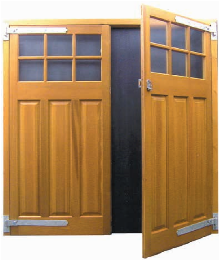
MIDDLETON with Traditional hardware