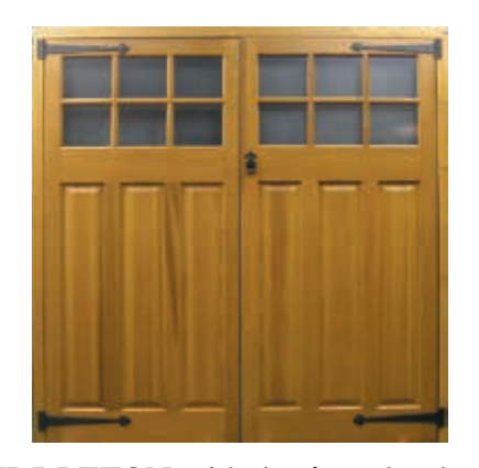
MIDDLETON with Antique hardware