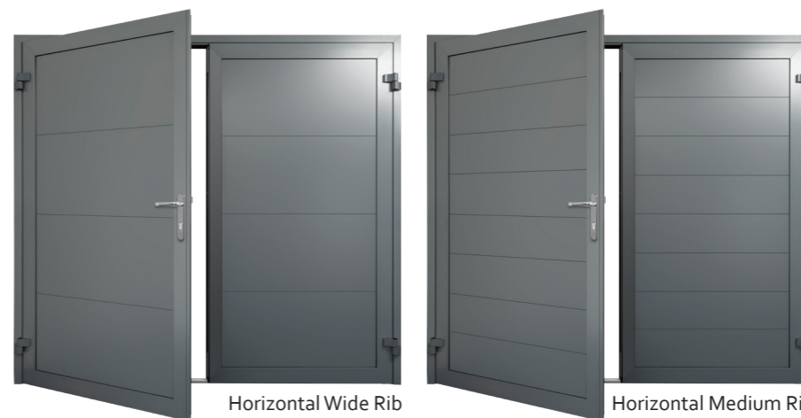
Horizontal Wide Rib

Stainless steel pull handles are a sleek alternative to the standard lever handle and are supplied with a ball catch and deadlock.