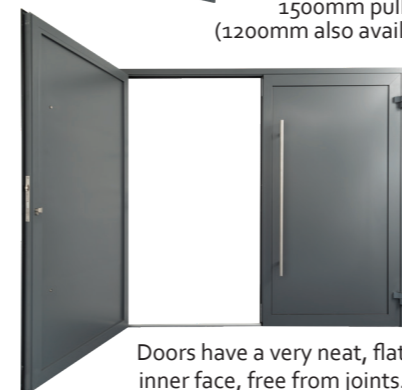
Doors have a very neat, flat inner face, free from joints.