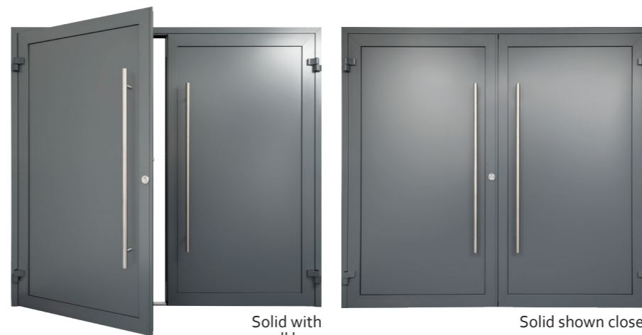
Solid with 1500mm pull bars (1200mm also available)