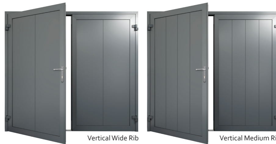
Vertical Wide Rib