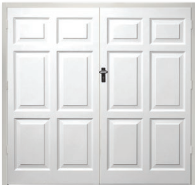
Georgian (High Gloss)